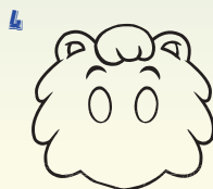
Draw Singa's eyebrows and eyes