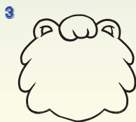
Draw Singa's ears