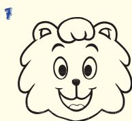
Draw Singa's mouth to give him a big smile