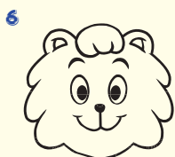
Draw Singa's nose and mouth