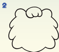
Draw Singa's hair