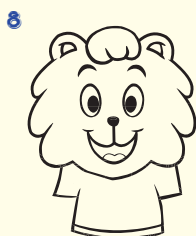
Draw Singa's shirt