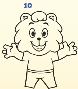
Draw Singa's arms