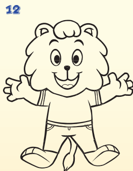
Draw Singa's shirt and the details of his pants