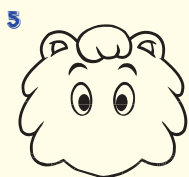
Draw Singa's pupils