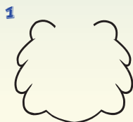
Draw Singa's face

Singa is a cheerful cub who wants to change the world by making it a kinder place. He loves playing sports and enjoys making new friends!