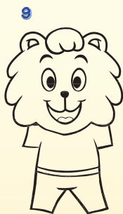
Draw Singa's pants