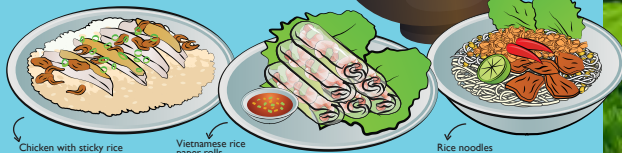
Chicken with sticky rice

Vietnam is one of the world's largest producers and consumers of rice! The Mekong Delta in southern Vietnam grows nearly half of the country's rice.