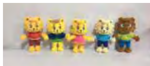
Limited edition set of Singa and the Kindness Cubbies plush keychains