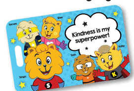
Kindsville Bag Tag