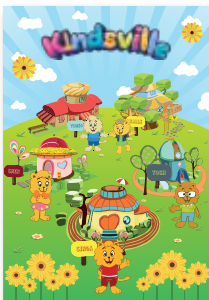
Kindsville A4 Folder