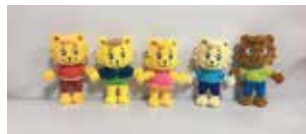
Limited edition set of Singa and the Kindness Cubbies plush keychains