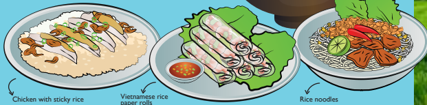
Chicken with sticky rice

Vietnam is one of the world's largest producers and consumers of rice! The Mekong Delta in southern Vietnam grows nearly half of the country's rice.