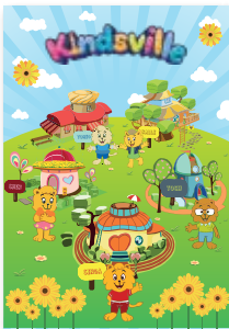
Kindsville A4 Folder