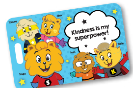
Kindsville Bag Tag