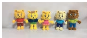
Limited edition set of Singa and the Kindness Cubbies plush keychains