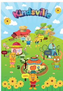
Kindsville A4 Folder