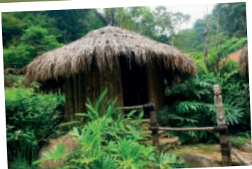
"Honai" house in Indonesia