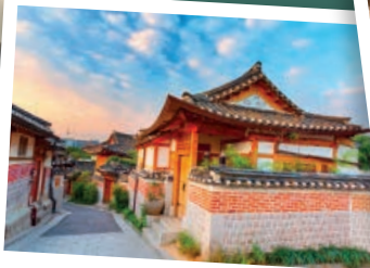
"Hanok" in Korea