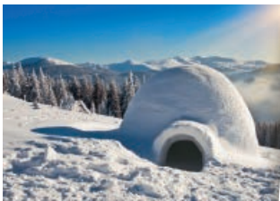
Igloo in Canada