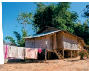
Bamboo house in Thailand