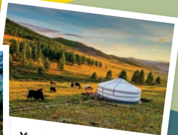
Yurt in Mongolia