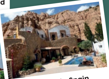
"Cueva" in Spain