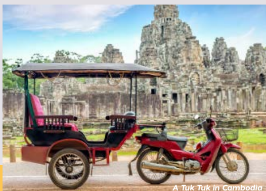
A Tuk Tuk in Cambodia

Tuk Tuk drivers are really friendly and always ready to chat. Shall we learn some greetings in Cambodian language?