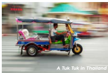
A Tuk Tuk in Thailand

Tuk Tuks were invented in Thailand and became popular in Cambodia. The name Tuk Tuk comes from the "tuk-tuk-tuk" sound of the motor.